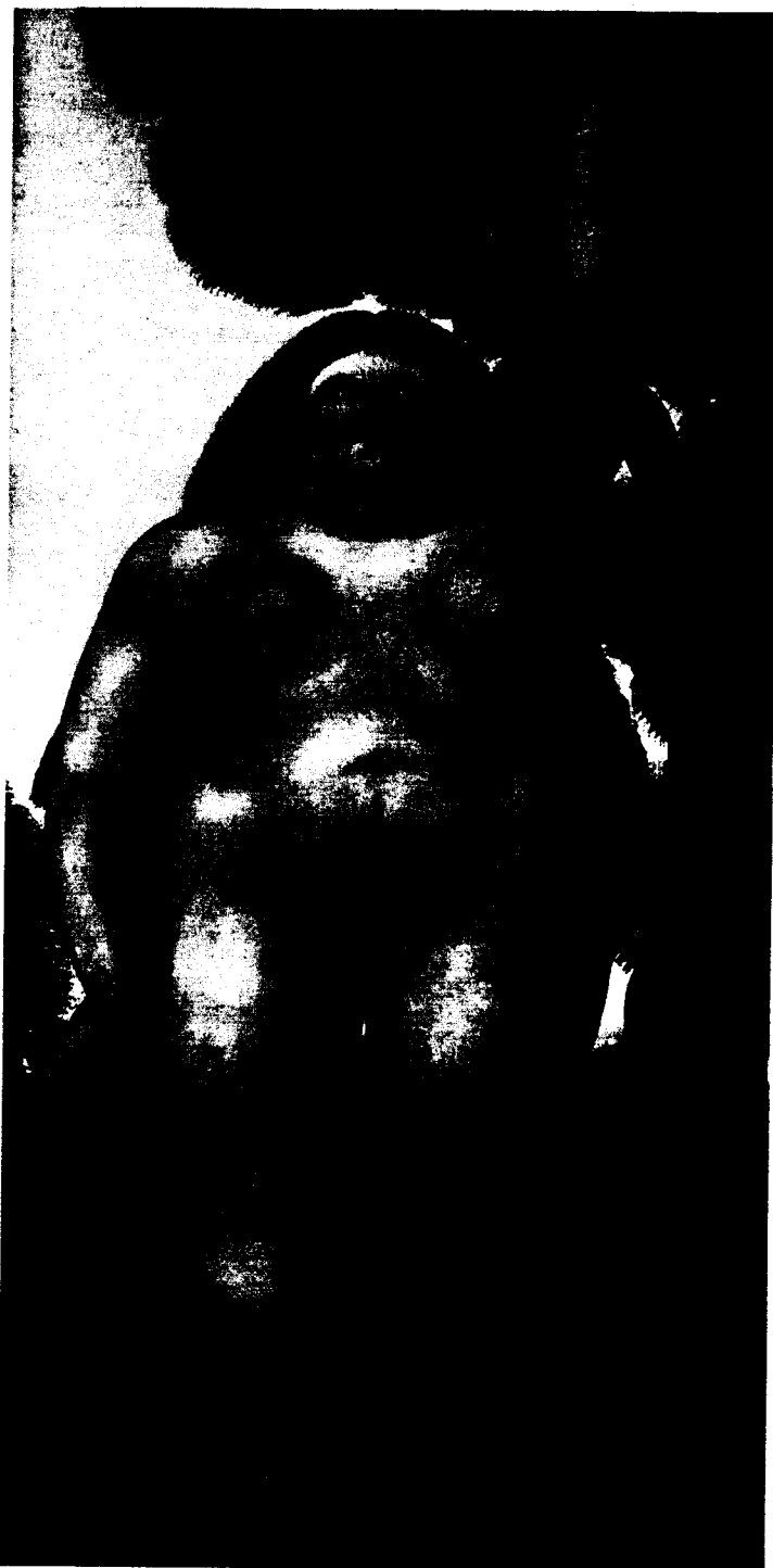
Fernando Botero, Adam and Eve, 1979

These archaic humans eventually gave way, worldwide, to the modern subspecies, Homo sapiens sapiens , whose oldest remains—fragments of bone found in various sites south of the Sahara—date to about one hundred and twenty thousand years ago, eighty thousand years earlier than any found in Europe or Asia. This age difference—combined with evidence that Africans used sophisticated