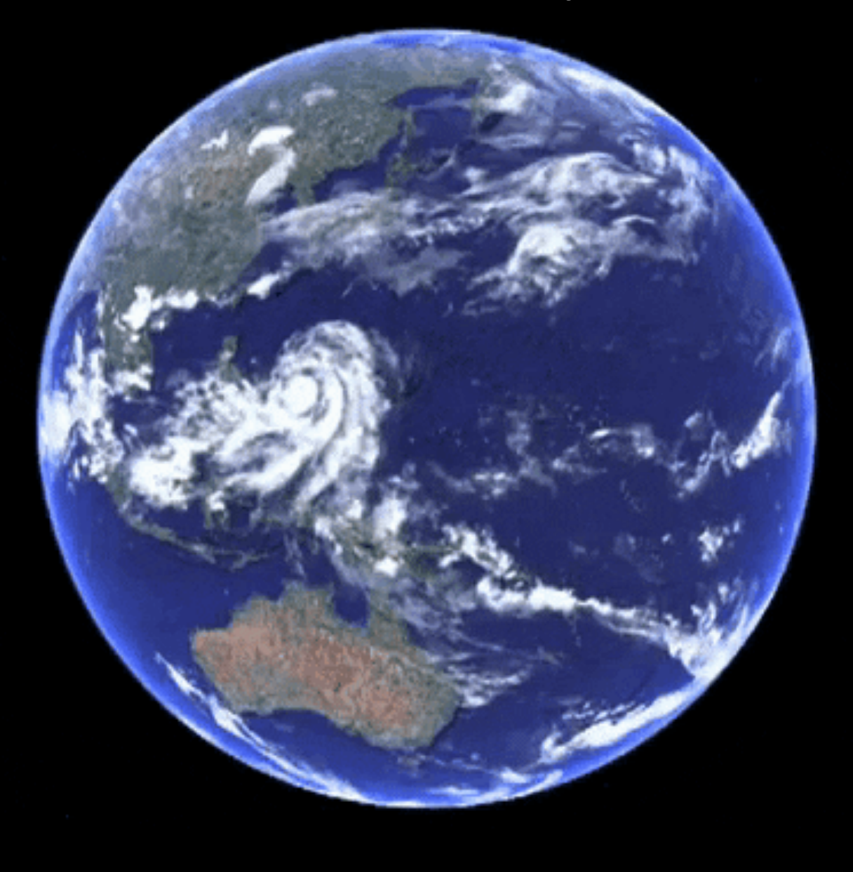
Every 24 hours planet earth makes a 360 degree spin at 1,000 mph