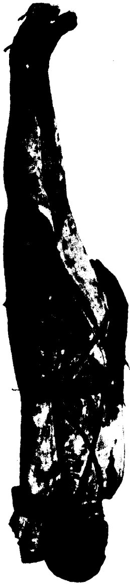
b. 64 (6704)