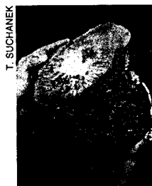
Lingering death. A rudist.